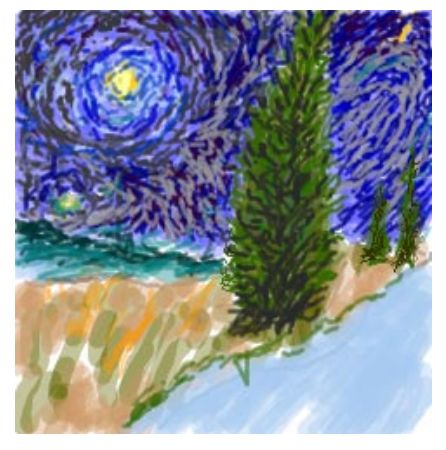
Add more details in the sky and a few more trees here and there.