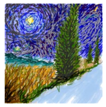
Continue to pile on layers of strokes in the sky, foreground and start on the grass blades. Always starting from lighter to darker strokes.