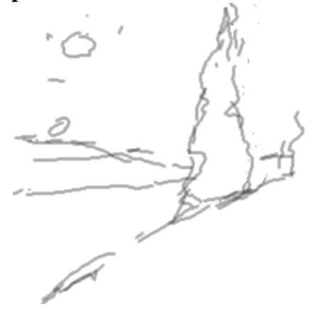
With your stylus pen draw out a rough sketch of your subject matter